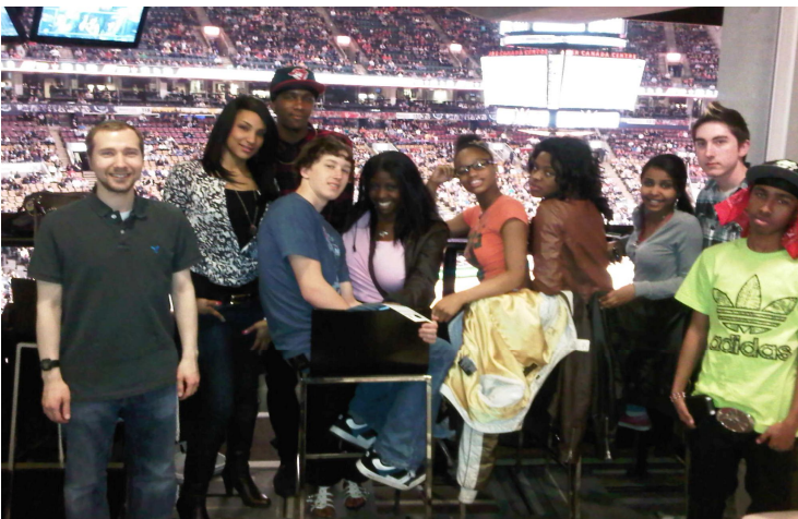
RY students from Henry enjoying a Rantors Game.