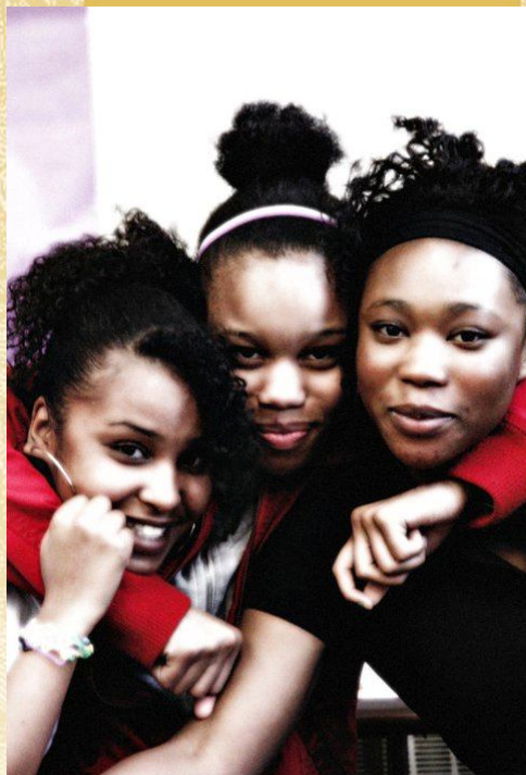
Henry students enjoying fashion and photography in the ASP.