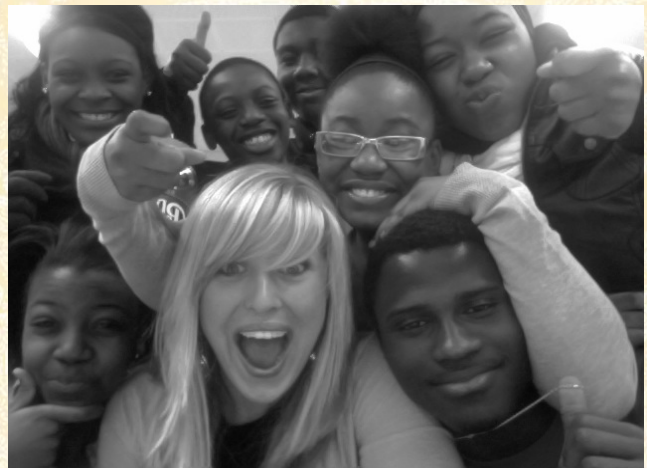
Making silly videos at Nelson A. Boylen

✿ “Most of us weren’t friends and we didn’t even know each other before we started RY. Now when we see each other in the halls we have a different kind of a relationship and a special connection. None of us are strangers anymore.” –Grade 12 King Student