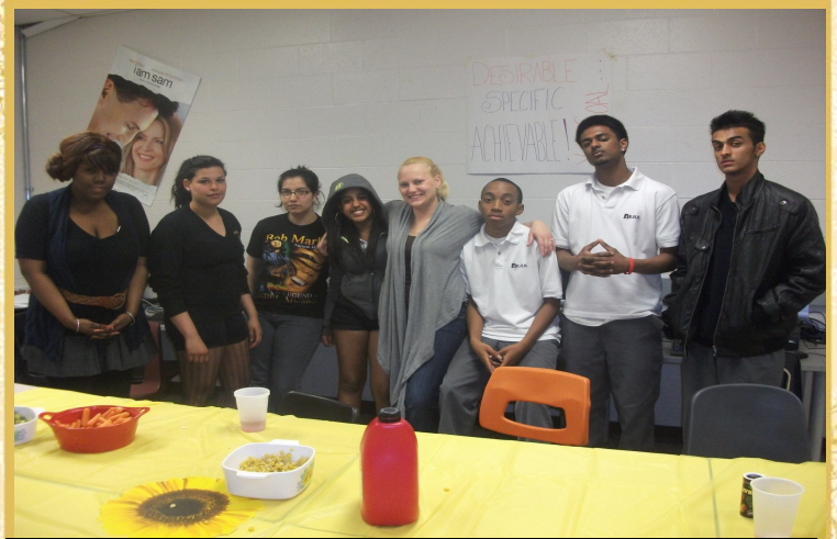
King Students at their Midterm Dinner “Pass the Gravy”